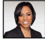
Angela D. Alsobrooks County Executive